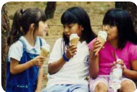
Native American girls at a previous camp week

In Luke 11, Jesus tells about a man who arrives hungry and late at night to his friend's house. The friend has the desire to help but lacks the resources needed. The friend goes to his neighbor to get help, knowing that his neighbor has