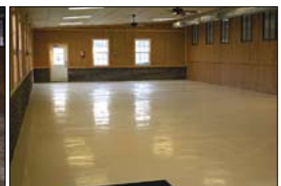
Patio floor finished