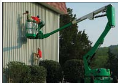
JRR Aud. re-painting in progress