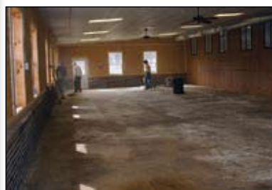
Patio floor in progress