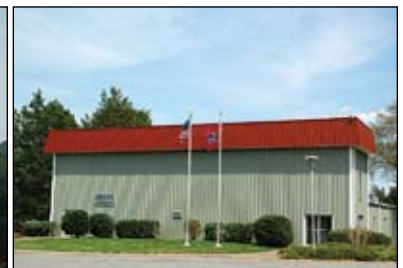
JRR Aud. re-painted